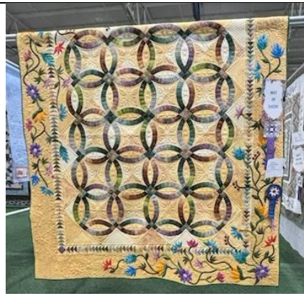
Best of Show